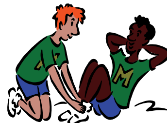
Next Month's Theme: Health/PE and Summer Learning.