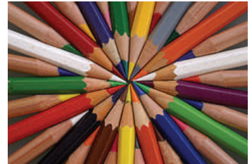
Shaping Hearts and Hands